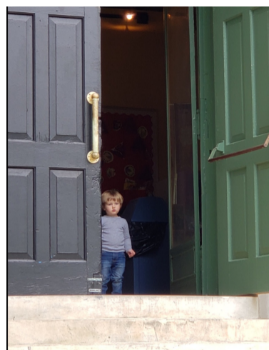
The Rice Mansion