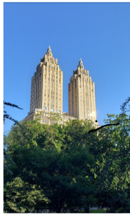
San Remo Beresford Eldorado By Architect Emery Roth