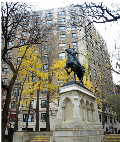
Joan of Arc